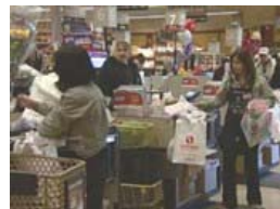
1 of 1 Click to enlarge